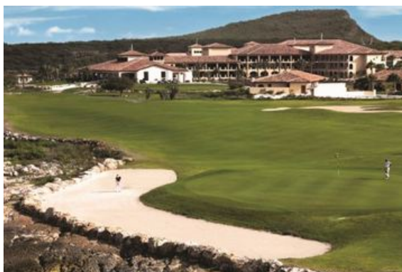
In addition to Old Quarry Golf Course, Curacao offers diving, fishing, sailing, tennis or just venturing out to the beaches throughout the island.

CURACAO, Netherlands Antilles -- Mount Tafelberg looms over Pete Dye's Old Quarry Golf Course like President Hugo Chavez rules Venezuela and eccentrically imagines he owns this Caribbean island. He doesn't own it -- the Dutch do.